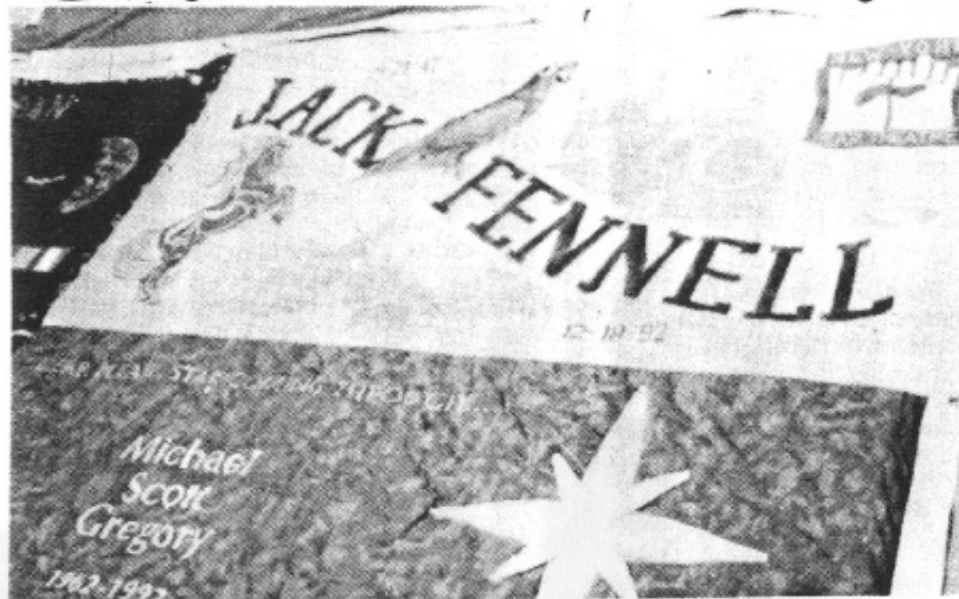
An AIDS' memorial in the form of a huge quilt remembered the thousands of New Yorkers who have succumbed to the killer virus.