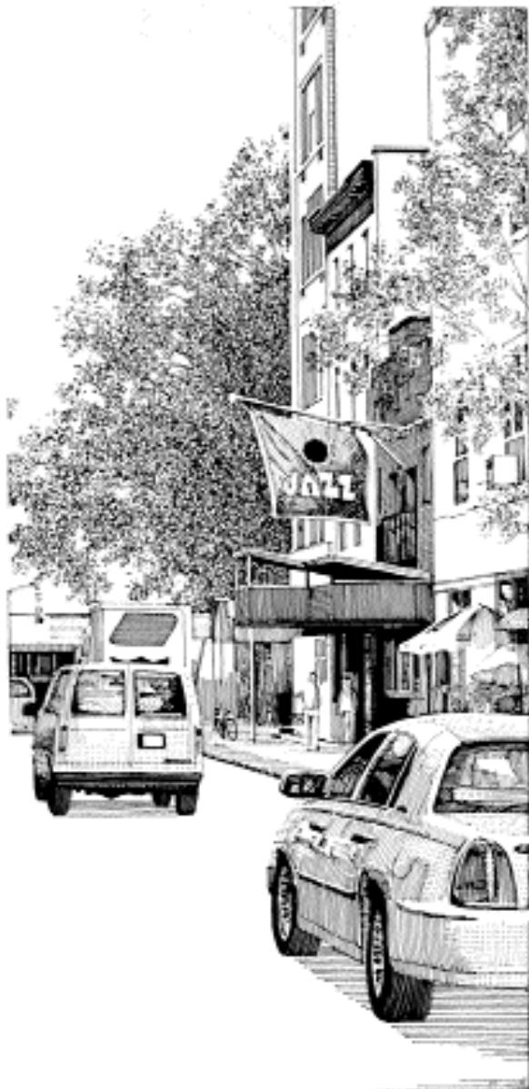
© ANDREW JARVIS / NY 2006