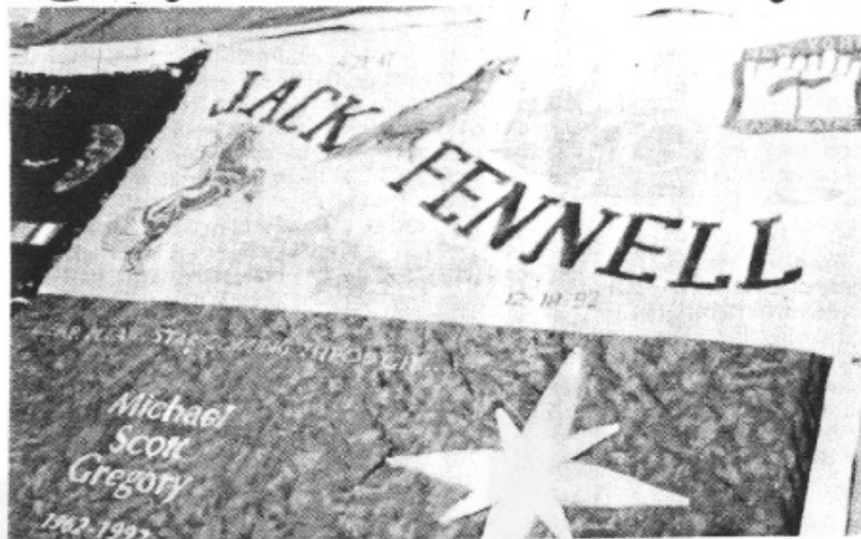
An AIDS' memorial in the form of a huge quilt remembered the thousands of New Yorkers who have succumbed to the killer virus.